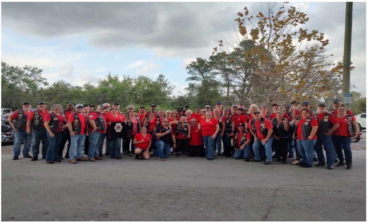
2024 Spring Rally, Dover Florida