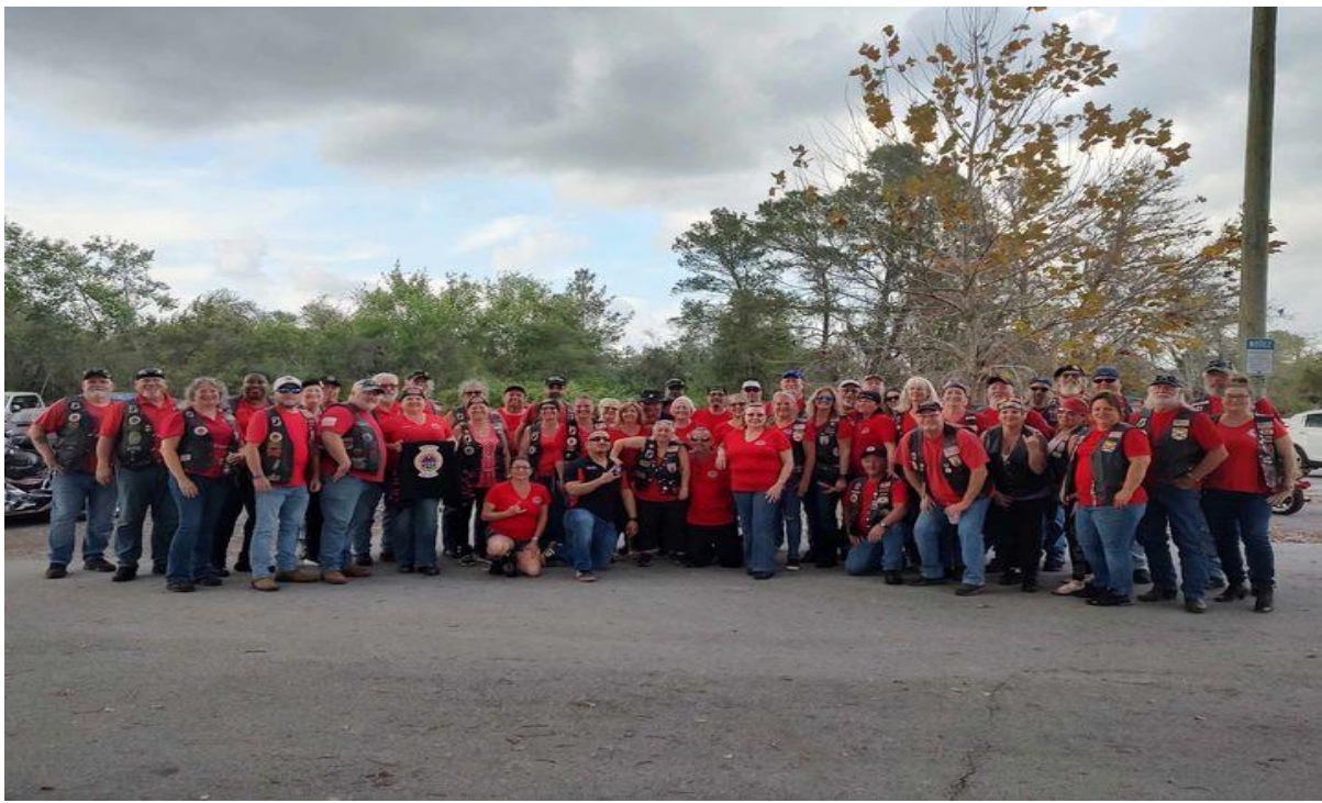
2025 Spring Rally, Dover Florida